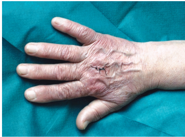
Figure 4. Illustrative example of a patient with acrodermatitis chronica atrophicans.

1. Available data indicate that acrodermatitis chronica atrophicans may be treated with a 21-day course of the same antibiotics (doxycycline [B-II], amoxicillin [B-II], or cefuroxime axetil [B-III]) used to treat patients with erythema migrans (tables 2 and 3). A controlled study is warranted to compare oral with parenteral antibiotic therapy for the treatment of acrodermatitis chronica atrophicans.